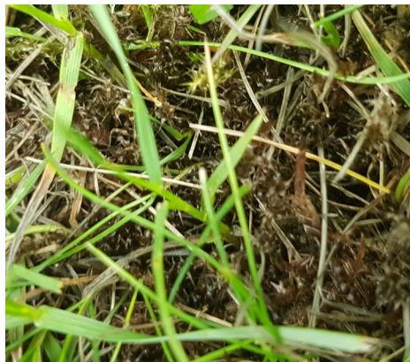
EXAMPLE OF MOSS TREATED WITH MOSS KILLER BLACKENING